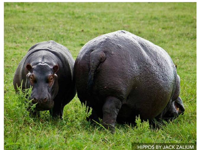
HIPPUS BY JACK ZALUIM