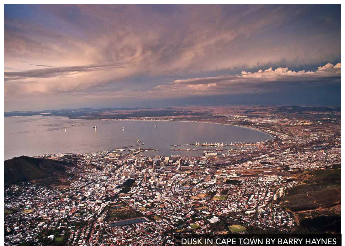
DUSK IN CAPE TOWN

Today begins at the Nelson Mandela Gateway, next to the iconic clock tower on the Victoria & Alfred (V&A) Waterfront. Board the ferry for Robben Island in Table Bay, where former president Nelson Mandela and other political anti-apartheid activists were imprisoned for many years. Upon your return, explore the historical heart of the Bo-Kaap, the historic Malay quarter of Cape Town, for a Cape Malay cooking safari. Take a leisurely stroll through some of the historic streets for a chance to appreciate the extraordinary collection of pre-1840 architecture that resulted in this area